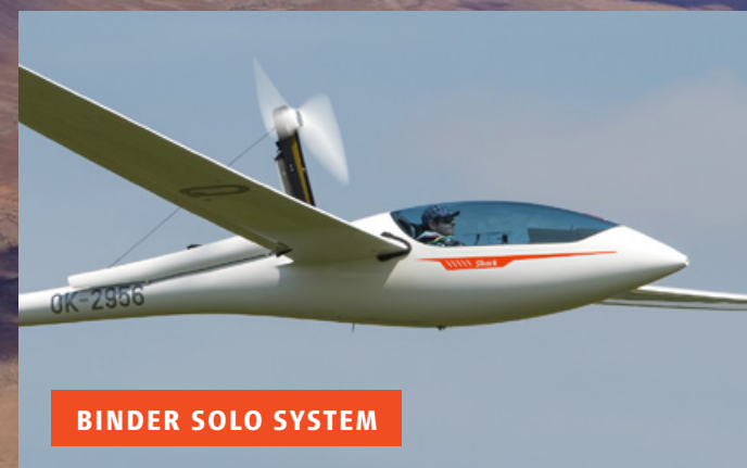
BINDER SOLO SYSTEM