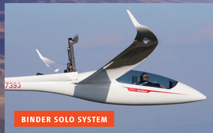
BINDER SOLO SYSTEM